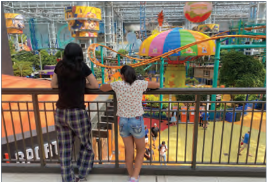
Family fun at Mall of America provided by Radisson Blu.